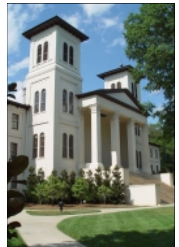
Wofford's Old Main Building

Spartanburg is easily accessible by car or air; the Greenville-Spartanburg International Airport serves most major airlines and is located just 20 minutes from campus. The Charlotte and Asheville airports are each just about an hour away.