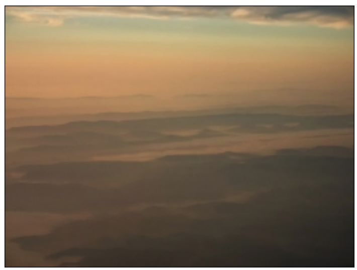
Sunrise over the Appalachian Mountains of West Virginia/Virginia.

For myself and many, the heart of the matter remains ASLE's vibrant interdisciplinarity. I want to see how the organization can further that—what promising new interstices can be articulated between the literary and other domains ASLE addresses: grassroots activism, environmental justice, natural resources policy, and environmental ethics, for example. I also run for the EC as a member of an American minority. As a rural American who lives in a county larger than Connecticut and Rhode Island, with about one person per square mile, I represent a receding demographic segment. I have quite a bit of experience in my adopted region of the Northern Rockies, having resided in southwestern Montana for the past seventeen years. As such, I bring a rural perspective to bear upon ASLE policies. That voice, I would argue, needs to be at the table along with those of my friends who live amidst and write about urban nature.