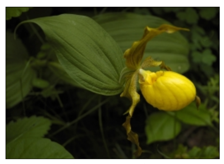
Yellow Lady's Slipper (Cypripedium pubescens), St. Malo Provincial Park, Manitoba, Canada.

ASLE has been blessed with extraordinary leadership since its inception. I am honored to be nominated for vice president and, if elected, will work tirelessly and with enthusiasm on your behalf. Thank you for considering me for this position.