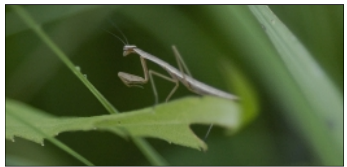
Praying Mantis (Mantis religiosa), Highlands Nature Sanctuary, Highlands County, Ohio.