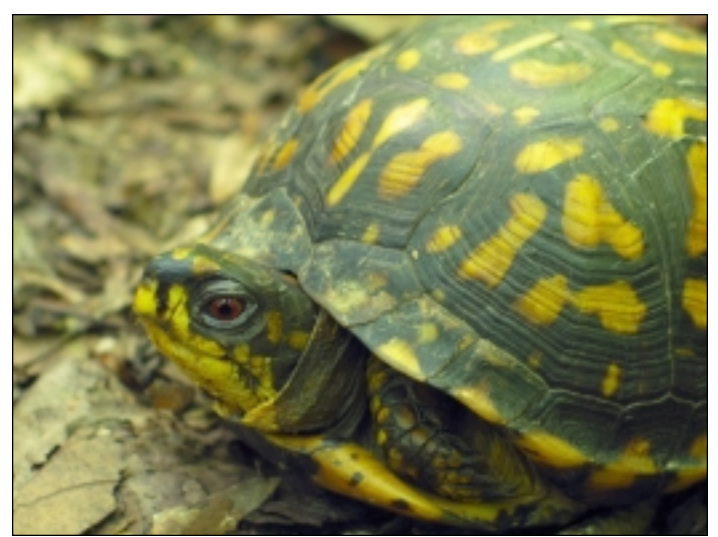
Eastern Box Turtle, (Terrapene_carolina), Bull Run Mountain, Prince William County, VA.