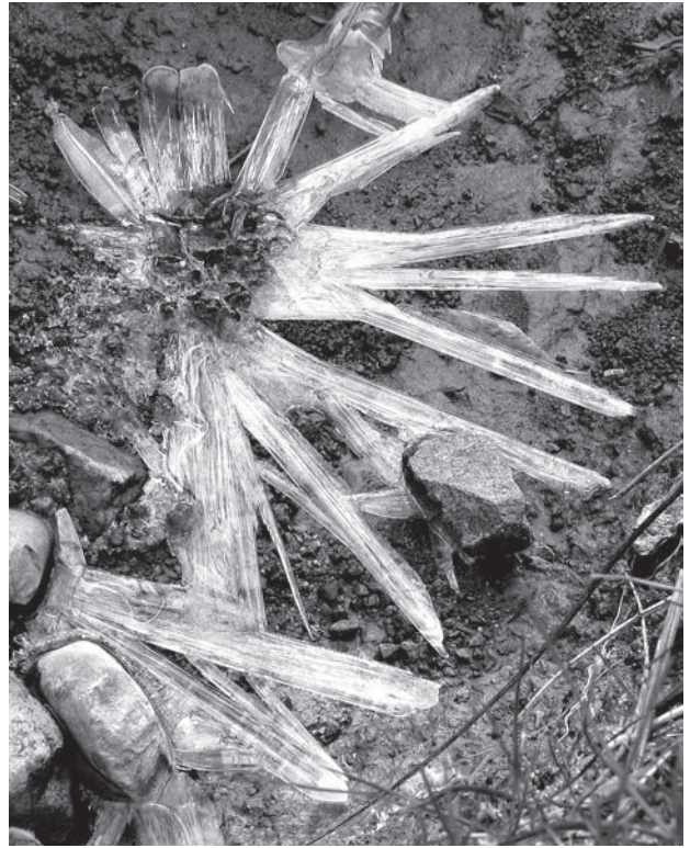
Ice in "bloom" at Battelle-Darby Metro Park, Franklin County, Ohio.