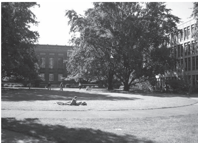
The University of Oregon in Eugene, where ASLE's Sixth Biennial Conference will be held June 21-25, 2005.

Other plans in the works: We'll have sessions on many aspects of environmental justice; on real and imagined eco-utopias and dystopias; on such working landscapes as farms and forests; on poetry and poetics, fiction, and various "sister arts" like film and photography; on the Pacific Northwest, both above and below the border; and on ideas about nature that have held sway in other corners of the world, such as Asia, Australia, and parts of Europe. Look for papers on wilderness, urban nature, ecocriticism,