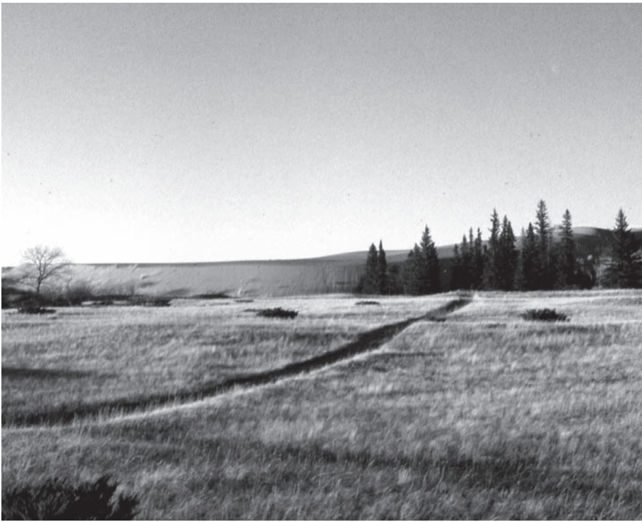
Spirit Sands, Spruce Woods Provincial Park, Manitoba, Canada.