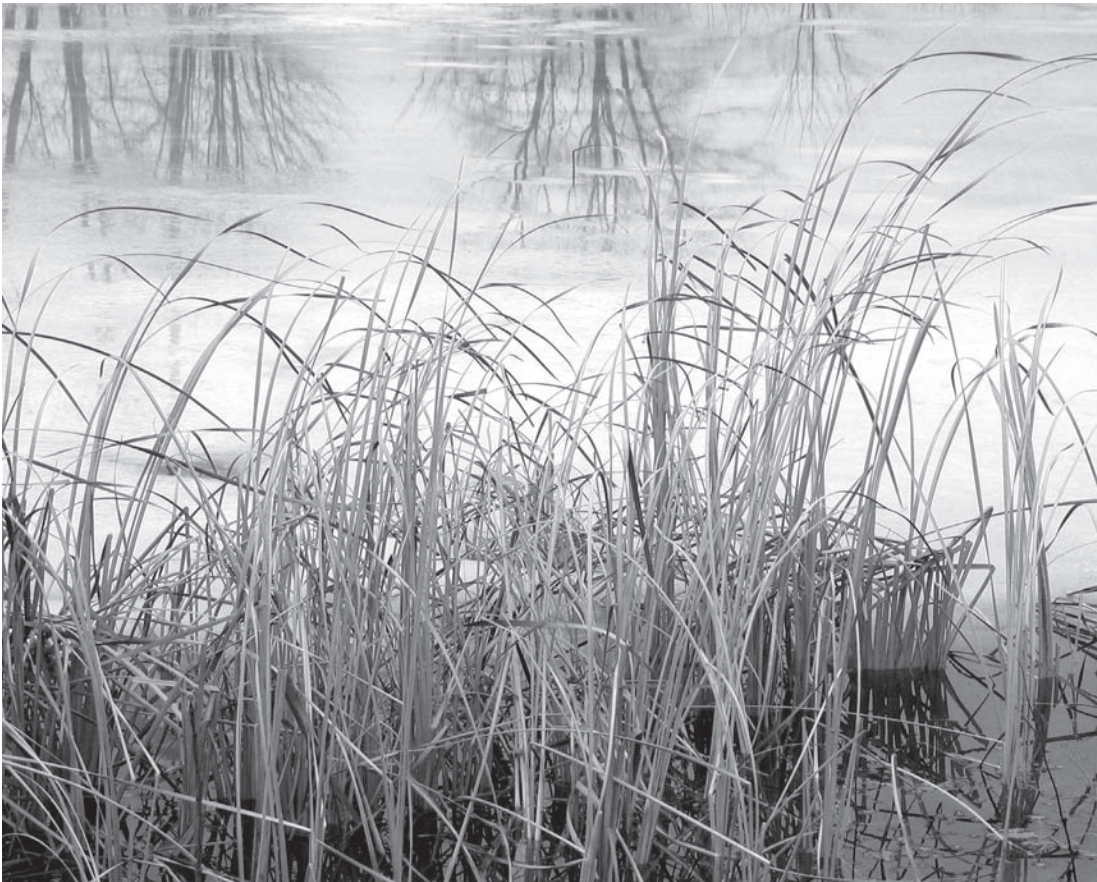
New Year's thaw, Franklin County, Ohio.