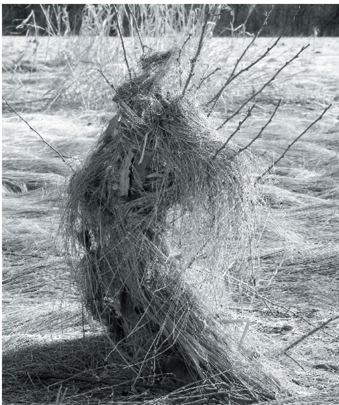
Grasses after flooding along Big Darby Creek, Prairie Oaks Metro Park, Madison County, Ohio.