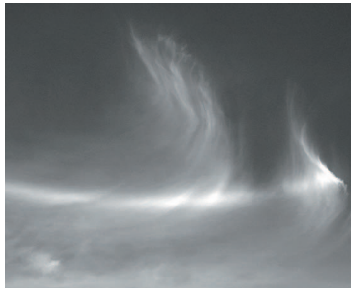
Cloudbow over Prairie Oaks Metro Park, Madison County, Ohio.