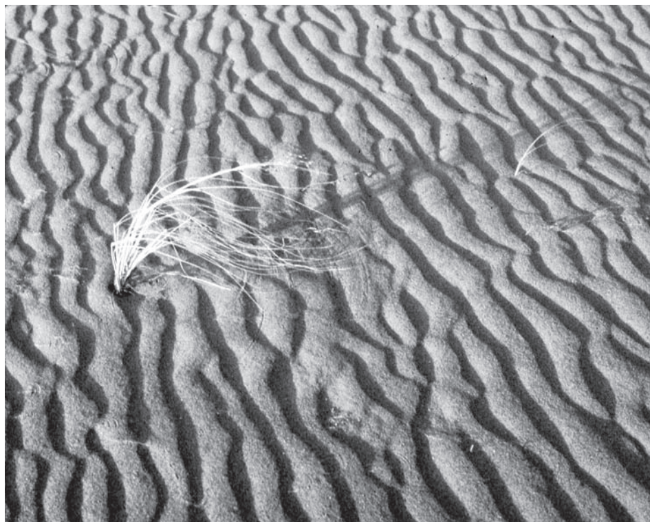
Wind on the dunes, Spruce Woods Provincial Park, Manitoba, Canada.