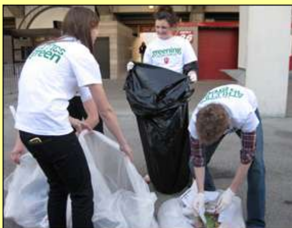
Volunteers participate in "Greening Cream & Crimson," part of a comprehensive effort to make IU Athletics a sustainability success story

The newly created Office of Sustainability (IUOS) used the Campus Sustainability Report for a roadmap; many of the former Task Force members now serve on a new Campus Sustainability Advisory Board which has seven Working Groups, each with 20 to 30 members. A new Student Sustainability Council, made up of student leaders from 22 student organizations, also provides input and assistance to the Office of Sustainability. This group recently gathered 11,000 petitions to start a Student Sustainability Fund, which will be funded through a voluntary $5 donation at registration.