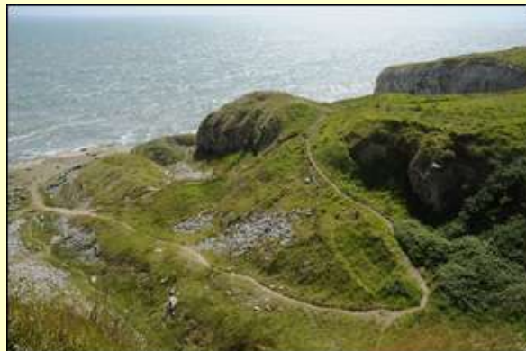
Southwest Coast Path, Isle of Purbeck, Dorset, UK.