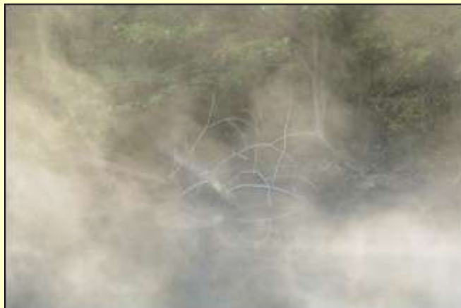
Foggy sunrise, Taloden Pond, Highlands Nature Sanctuary, Highlands County, OH.