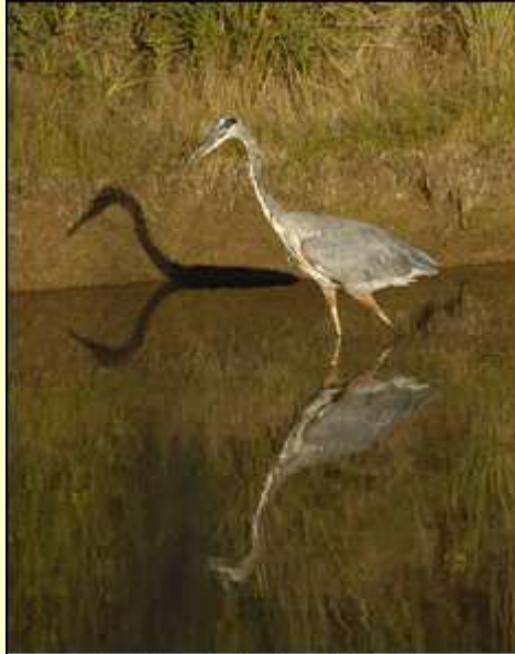
Great Blue Heron ( Ardea herodias) hunting at sunset, Olentangy River Wetlands Research Park, OH.