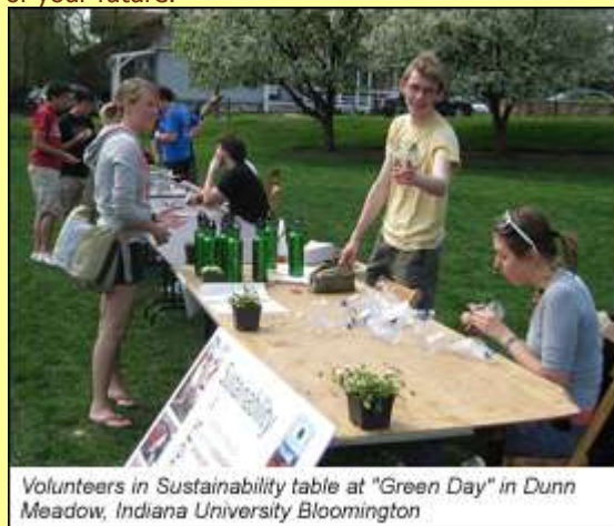
Volunteers in Sustainability table at "Green Day" in Dunn Meadow, Indiana University Bloomington

This proposed 2020 Vision and the 20 ambitious goals that accompanied it are intended to catalyze a broader discussion about how best to propel Indiana University to a position of leadership in the great challenge and great opportunity of our time. You are welcome to be a part of that discussion of your future.