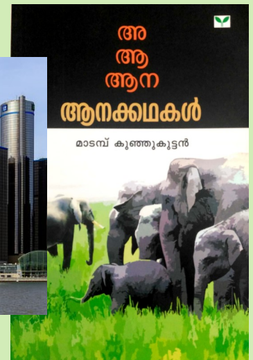
Some Past ASLE Grant Winning Projects